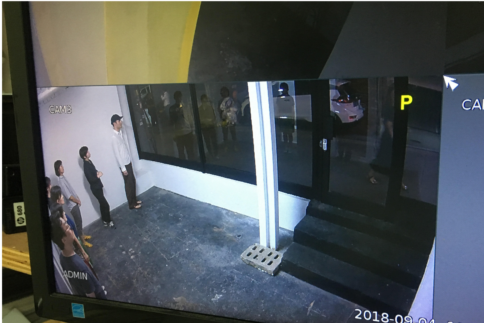
Le Trou (구멍), Walk Piece, 70 min, end as seen through the cctv of Amado Art Space.