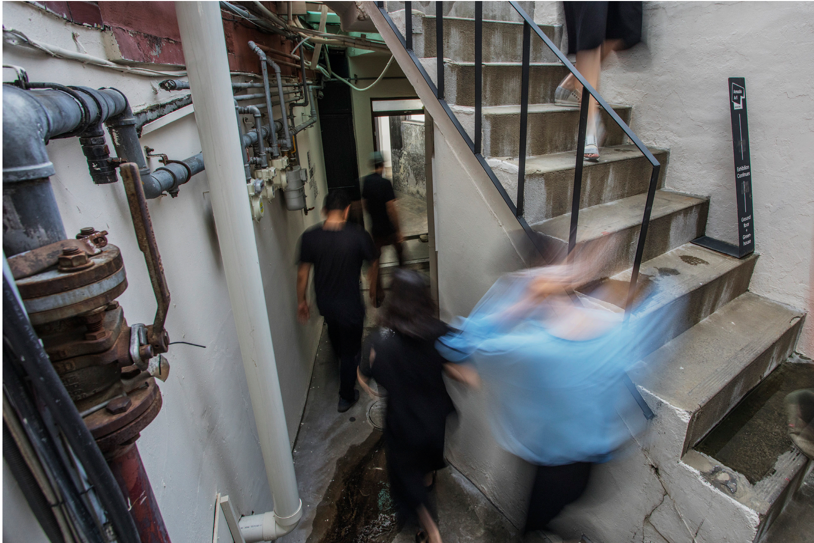
Le Trou (구멍), Walk Piece, 70 min, beginning.